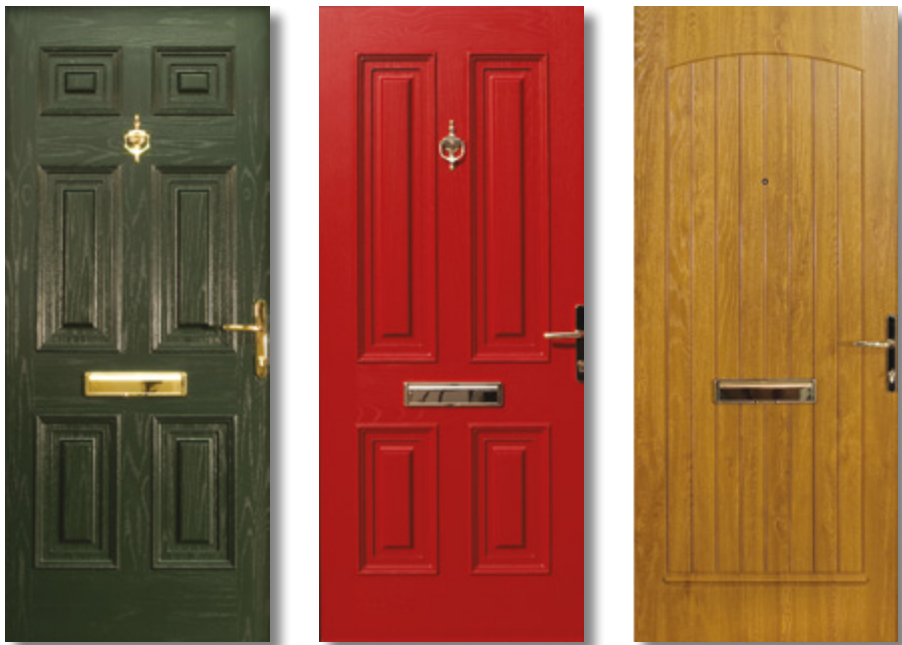
Georgian CD Solid Palermo CD Solid T&G Solid