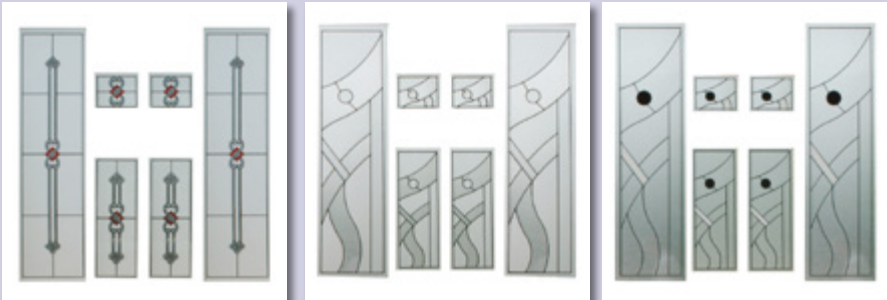
Glass type: TG10 Satinized Glass type: TG11 Satinized Glass type: TG12